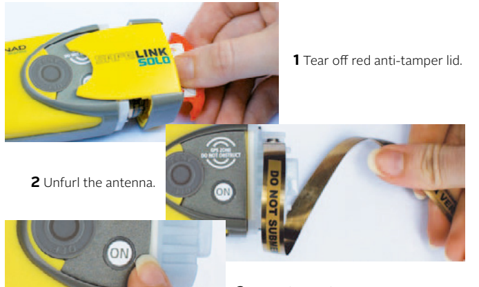
3 Press the ON button.